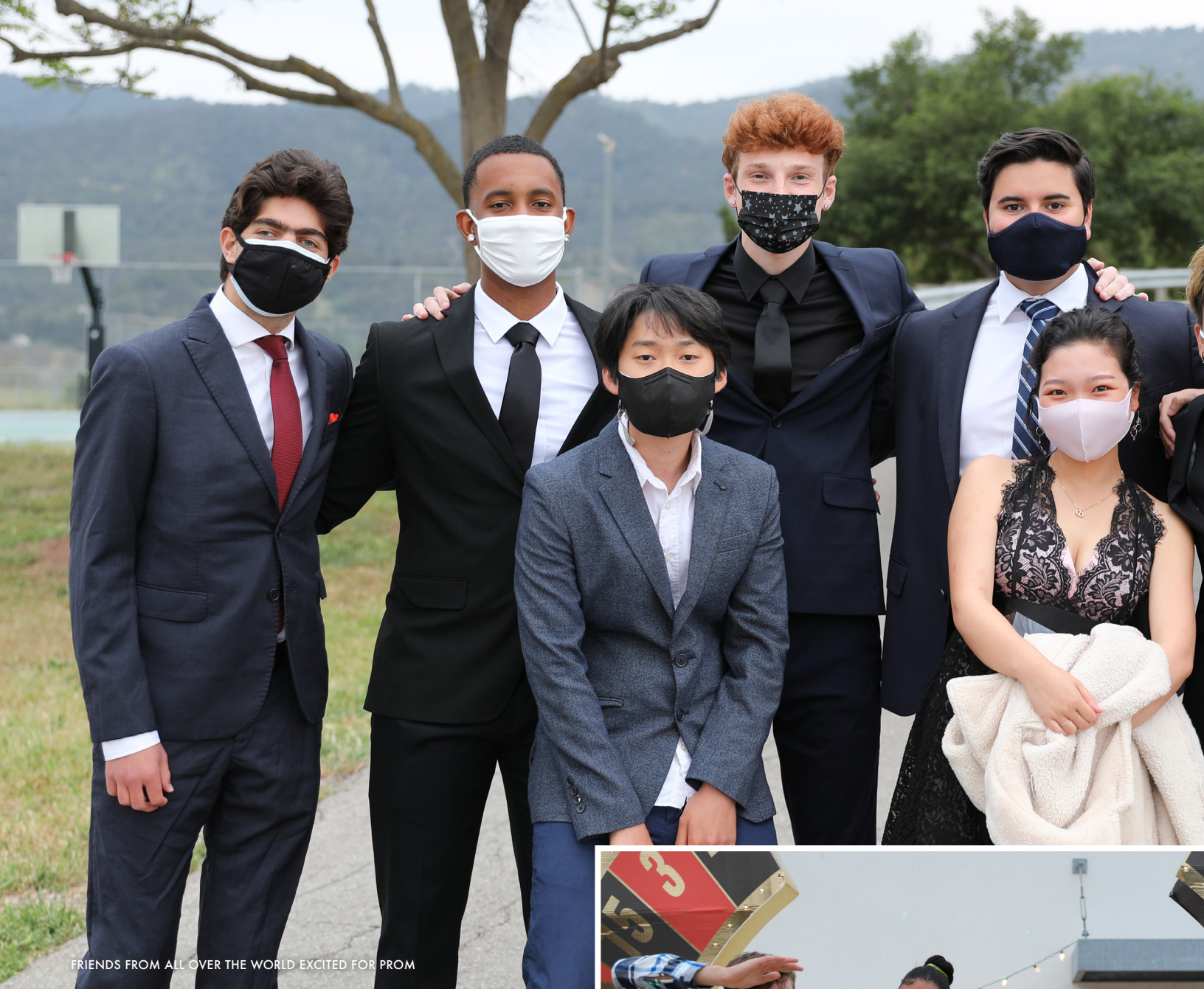
FRIENDS FROM ALL OVER THE WORLD EXCITED FOR PROM

only prerequisite is that you come ready for fun!