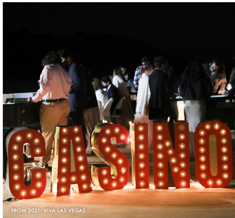
PROM 2021: VIVA LAS VEGAS

With the assistance of volunteers from other grades, the whole senior class worked to turn the Lee Sanders Aquatic facility and its surrounding area into our mini-version of Las Vegas. Students and faculty worked together to construct decorative props, string lights, hang backdrops and generally transform the space into our version of the glitzy extravagance of the city often referred to as "The Neon Capital of the world!" Because we did all of the Prom preparation ourselves, we could be incredibly proud of the results of our hard work, making the evening even more meaningful.