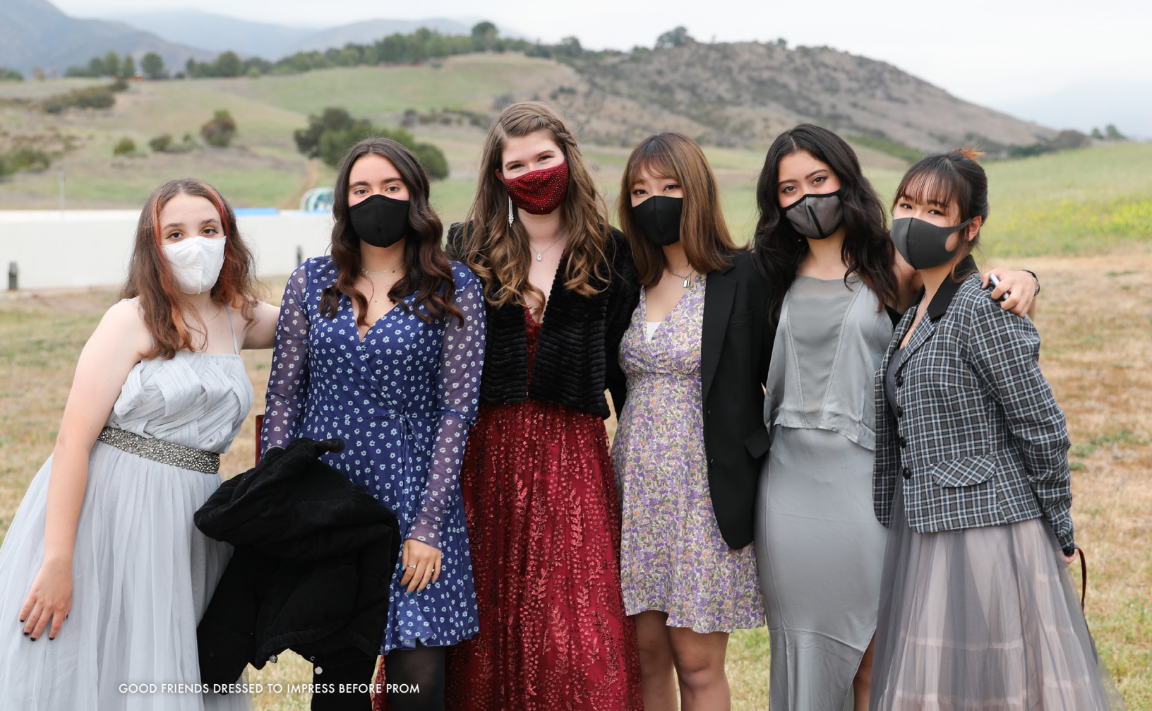
GOOD FRIENDS DRESSED TO IMPRESS BEFORE PROM