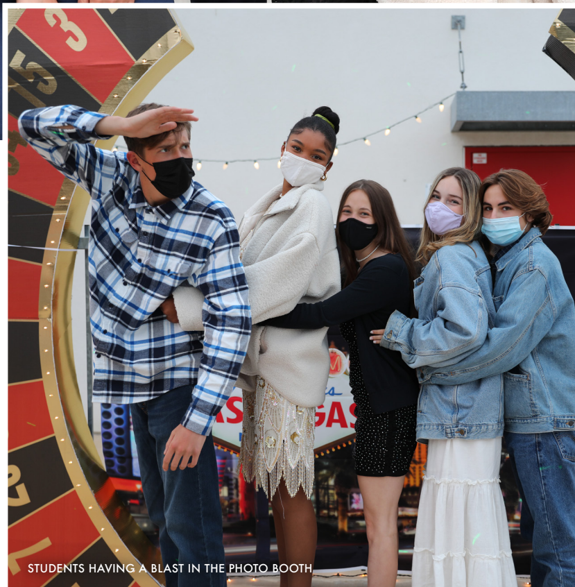
STUDENTS HAVING A BLAST IN THE PHOTO BOOTH

After dinner activities included games of chance, dancing under the stars to the music of DJ Ian, and a raffle for great door prizes.