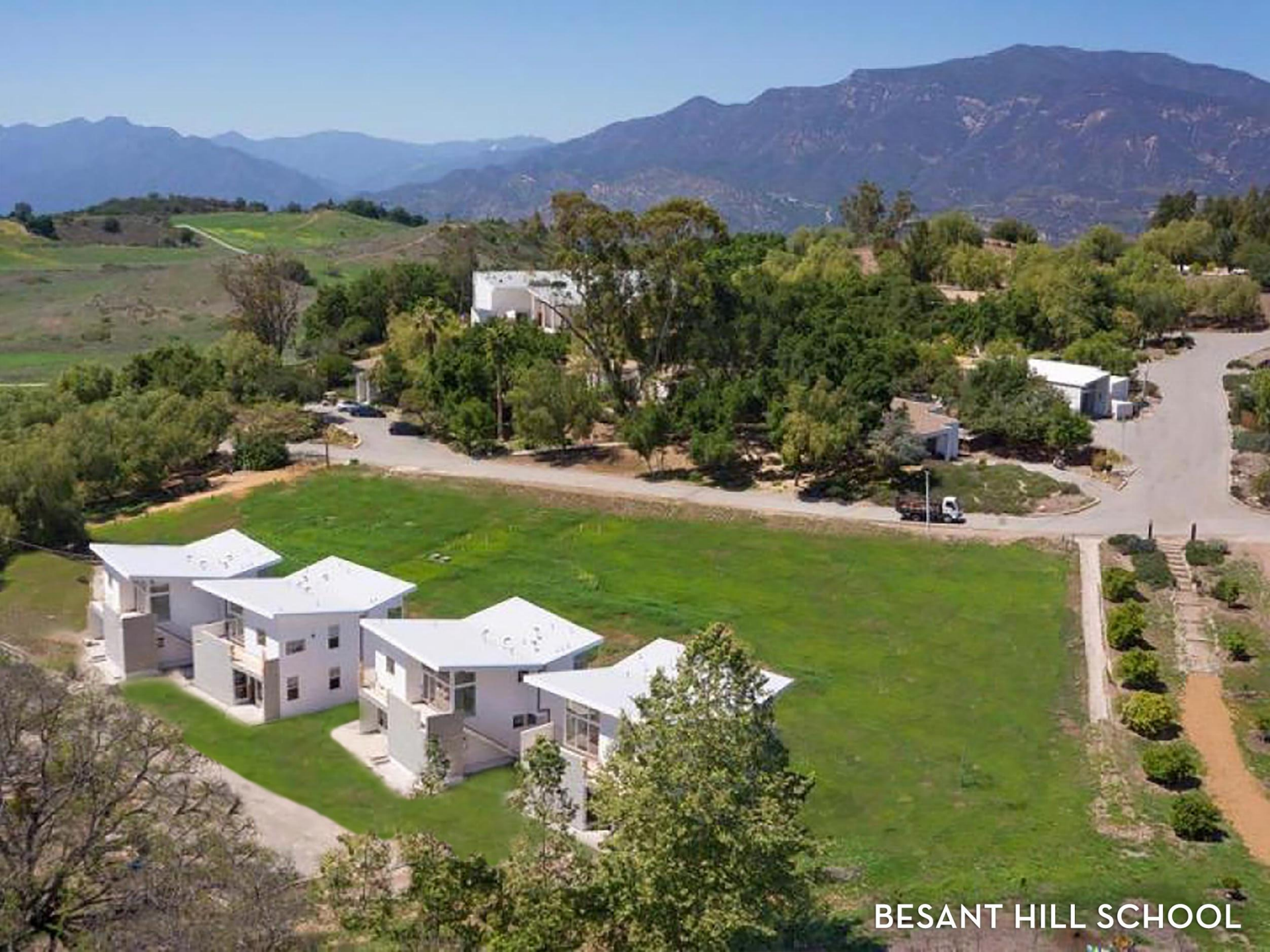
BESANT HILL SCHOOL